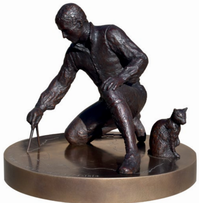
Matthew Flinders maquette

Flinders University is now even easier to get to with the opening of the new Flinders Railway Line and Flinders Station, offering students and other commuters a faster, smoother journey from the CBD, in just 22 minutes.