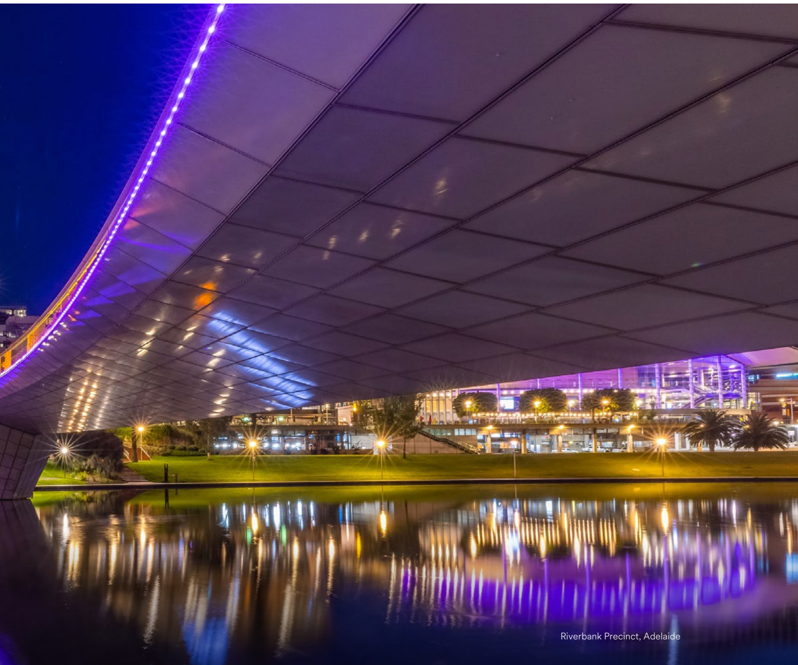
Riverbank Precinct, Adelaide

No longer a secret, Adelaide is a highly attractive city in which to live life to the fullest.